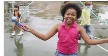
Health & Safety

The YWCA Southeastern Massachusetts was founded in 1911. Our Mission speaks to the elimination of racism and the empowerment of women. The organization has undergone major changes nationally, regionally and locally, but it continues "to create opportunities for women's growth, leadership and power." The YWCA adopted its One Imperative in 1970, "to thrust its collective power toward the elimination of racism wherever it exists and by any means necessary." We continue to work to that goal internally and throughout our service area. Our Board of Directors and staff reflect the diversity of the area with a concentrated effort to have many locales served.