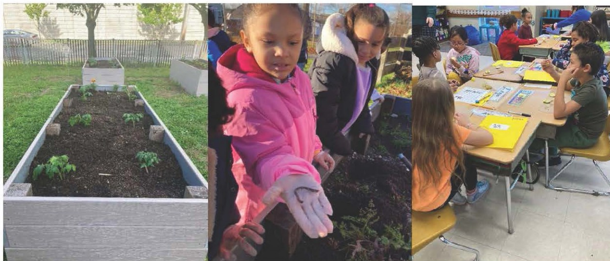
School garden lessons